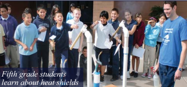
Fifth grade students learn about heat shields

The Mission of the Challenger Space Center is "to inspire, excite and educate people of all ages about the mysteries and wonders of space, science and the universe in which we live..." That's exactly what happened when the Challenger Mobile Lab came to visit. Scientists spoke about the space shuttle's design and the necessity of heat shields to protect it from catching fire and exploding upon reentry. They demonstrated that heat shields withstand and disperse heat away from the shuttle, keeping astronauts safe inside. They challenged students to build their own heat shields with simple materials, testing them to see if they