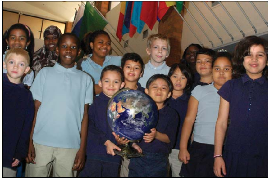
Students from Six Continents

Osborn is pleased to announce that Longview School has applied for the Primary Years Programme, the elementary curriculum for the International Baccalaureate (IB) program. Longview staff will commence teaching the program next fall. The International Baccalaureate is similar to Advanced Placement in that students may receive college credit for high school work; however, the baccalaureate diploma is recognized world-wide in more than 150 countries. Building continuity for Longview students to continue at North High School's IB program, Longview's program creates a strong foundation and increases their chance of earning the IB diploma. Osborn Middle School plans to apply for the Middle Years Programme next year. The International Baccalaureate curriculum will provide an international flavor to a school which already has a student body representing six continents.