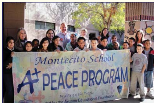
Montecito Peace Club Accepts A+ Award

Since then, the campaign moved from "I am part of the puzzle; I keep the peace", to "I am part of the puzzle; I spread the Peace", to this year's "I am part of the puzzle; I am the peace". All students also earn Montecito Peace t-shirts when they were 'caught' displaying positive behavior. Students and staff wear their peace shirts each Friday. Incidents requiring discipline have decreased 44% since its inception.