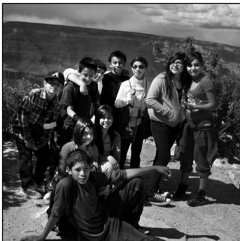
Above: Sixth Grade students from Carlos Ardon's Dual Language class.

Students were selected based on their academic effort over a three month period. Students worked together in small groups, helping