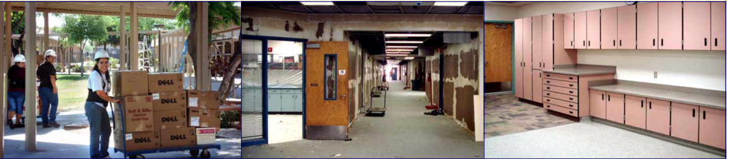
Schools are packed up to make way for construction work, shown here in before, during, and after photographs of Encanto and Longview