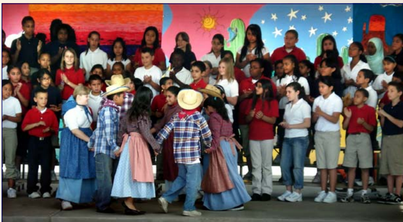
Solano 4th grade students perform "Arizona Musical" for Encanto students