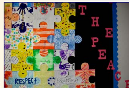
"I Am Part of the Puzzle... I Keep the Peace" mural initiated by counseling staff at Montecito Community School

Osborn aggressively pursues state and federal grants and private partnerships to further enhance student welfare and learning. As a result, the district spends a higher than average amount on Instructional Staff Support and Student Support to help meet the needs of our students. Osborn spends more total dollars per student than any of the greater Phoenix unified districts and more than the state average ($7,398 v. $6,833). Due to high poverty rates, many students come to Osborn with physical, social, emotional and learning needs that can't be met totally by dollars available through all too limited state funding or totally by the classroom teacher. Programs such as counseling, health services, after-school tutoring and enrichment classes and targeted professional development are paid for with non-classroom grant dollars and are absolutely vital in order to maximize student achievement.